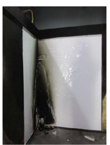
After Test (EN 13823)